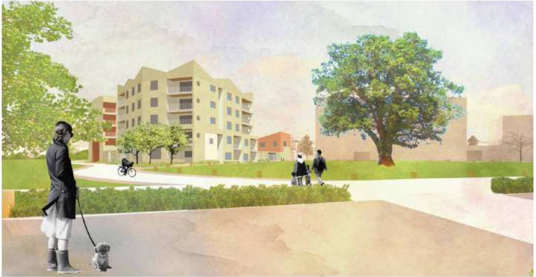
View across Veteran Oak along Ridgeway