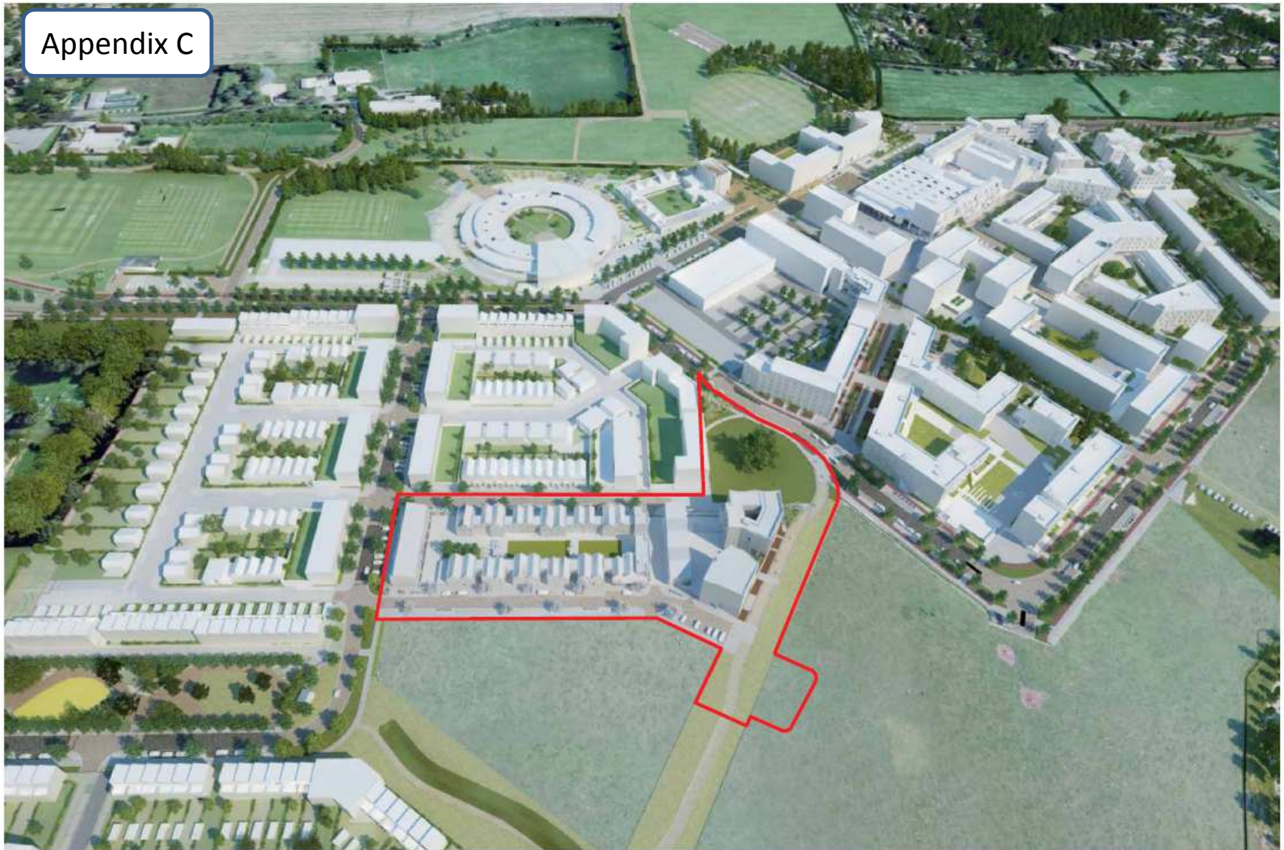
Above, Aerial view of Lot 4 (RMA boundary in red) as part of the Ridgeway Village